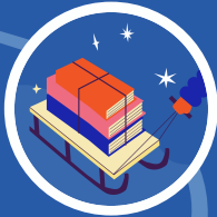
READ A BOOK FROM A LIBRARY CREATED LIST OR DISPLAY