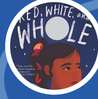
RED, WHITE, AND WHOLE

The 2023-2024 Winter Reading Challenge is brought to you by Normal Public Library Foundation, with generous contributions by Crabtree Financial LLC and their clients.