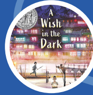
A WISH IN THE DARK