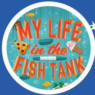
MY LIFE IN THE FISH TANK