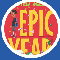
AHMED AZIZ'S EPIC YEAR