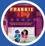
FRANKIE AND BUG