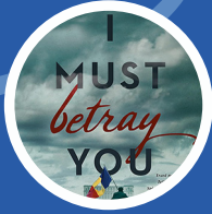
I MUST BETRAY YOU