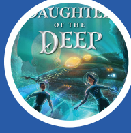
DAUGHTER OF THE DEEP