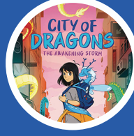
CITY OF DRAGONS