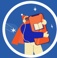
LISTEN TO AN AUDIOBOOK