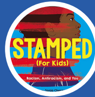
STAMPED (FOR KIDS)