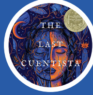
THE LAST CUENTISTA