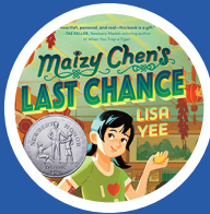
MAIZY CHEN'S LAST CHANCE