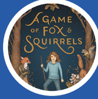
A GAME OF FOX & SQUIRRELS