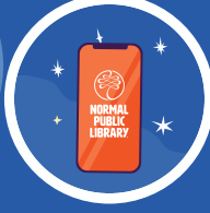
EXPLORE AN ELECTRONIC RESOURCE