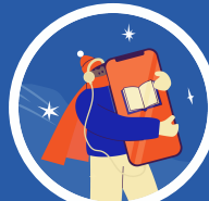
LISTEN TO AN AUDIOBOOK