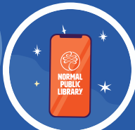
EXPLORE AN ELECTRONIC RESOURCE