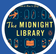
THE MIDNIGHT LIBRARY