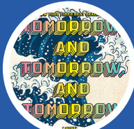
TOMORROW, AND TOMORROW, AND TOMORROW