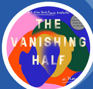
THE VANISHING HALF