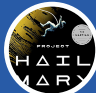
PROJECT HAIL MARY