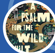
A PSALM FOR THE WILD BUILT