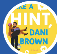
TAKE A HINT, DANI BROWN