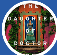
THE DAUGHTER OF DOCTOR MOREAU