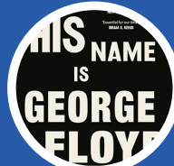
HIS NAME IS GEORGE FLOYD