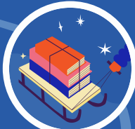
READ A BOOK FROM A LIBRARY CREATED LIST OR DISPLAY