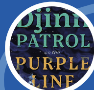
DJINN PATROL ON THE PURPLE LINE

The 2023–2024 Winter Reading Challenge is brought to you by Normal Public Library Foundation, with generous contributions by Crabtree Financial LLC and their clients.