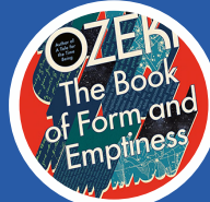
THE BOOK OF FORM AND EMPTINESS