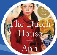
THE DUTCH HOUSE