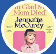
I'M GLAD MY MOM DIED