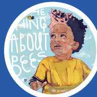
THE THING ABOUT BEES