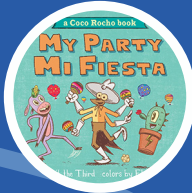
MY PARTY MI FIESTA