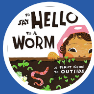
HOW TO SAY HELLO TO A WORM