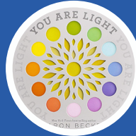
YOU ARE LIGHT