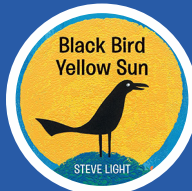
BLACK BIRD YELLOW SUN