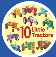
10 LITTLE TRACTORS