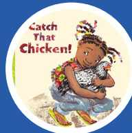
CATCH THAT CHICKEN!