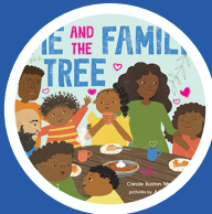
ME AND THE FAMILY TREE