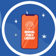
EXPLORE AN ELECTRONIC RESOURCE