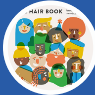
THE HAIR BOOK