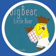
BIG BEAR, LITTLE BEAR