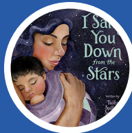
I SANG YOU DOWN FROM THE STARS